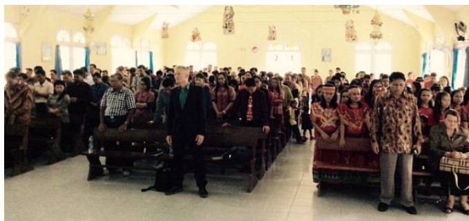
Photo: Pastors and leaders (almost 300) hungry for the gospel of grace and truth >>